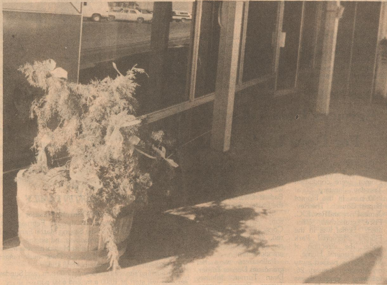
YELLOW RIBBONS FOR RELEASED HOSTAGES -- Matador did its part in welcoming home the freed hostages Sunday. Matador Variety store had yellow ribbons tied in front of the store on the small tree and Our Lady of Guadalupe Catholic Church pealed the church bells 444 times on touch down of Freedom One, the plane carrying the former hostages, at Stewart Air Base Sunday.