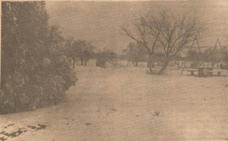
SPRING SNOW -- Residents in Motley County greeted another round of snow when they awoke Tuesday morning. The late storm hit Monday, and by Tuesday morning enough snow had fallen to cover the ground. However by Tuesday evening the sun was again shining and most of the white stuff had melted.