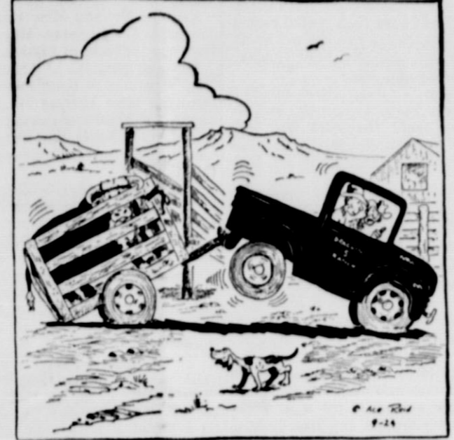
I don't know what's the matter. Been drivin' 50 and ain't moved an inch! This feature sponsored by THE FIRST STATE BANK