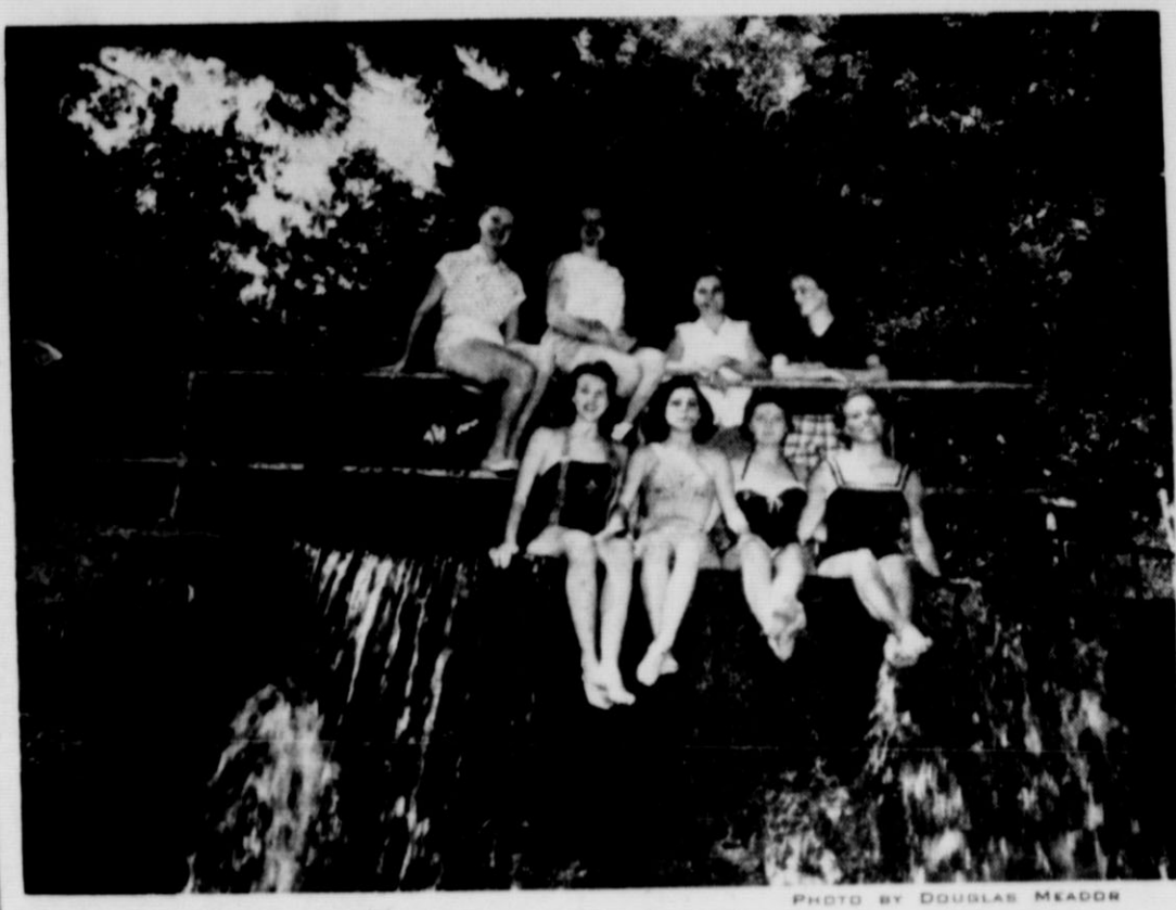
Cool Homemakers Beat the Heat