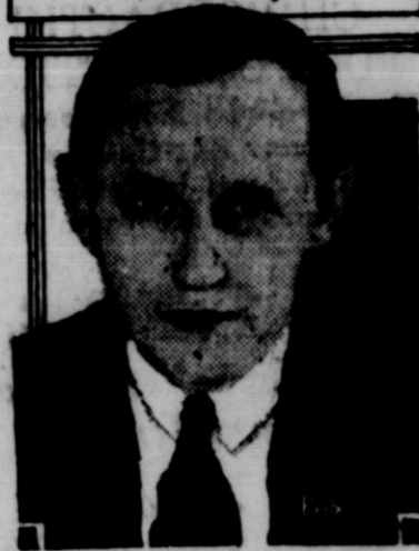
Harry L. Hopkins, Federal Relief Administrator, who has an appropriation of $600,000,000 with which to give jobs to 4,000,000 unemployed this winter, under President Roosevelt's new relief program.