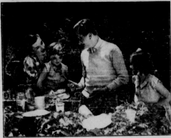
You can take a picture of the family picnic and be in it yourself by using a self timer.

THE question is often asked, "Is there any way that I can take a snapshot of my friends and include myself in the picture?"