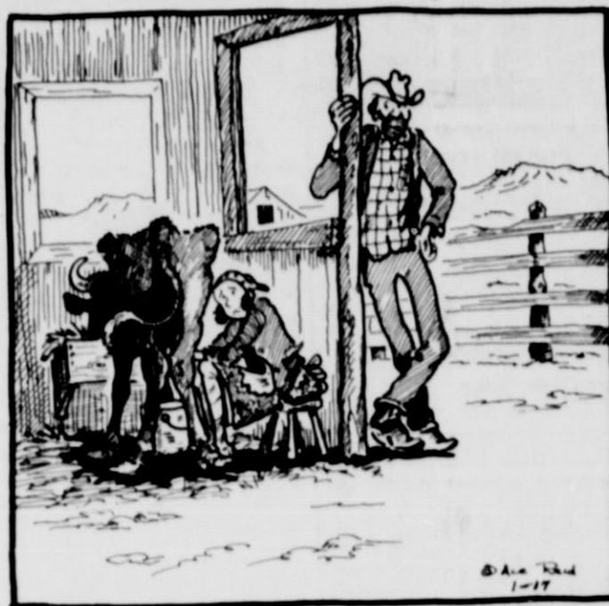
"Can't figure all them people goin' to the inauguration, Mawl Jist who's goin to do their milkin'!"

This feature sponsored by THE FIRST STATE BANK