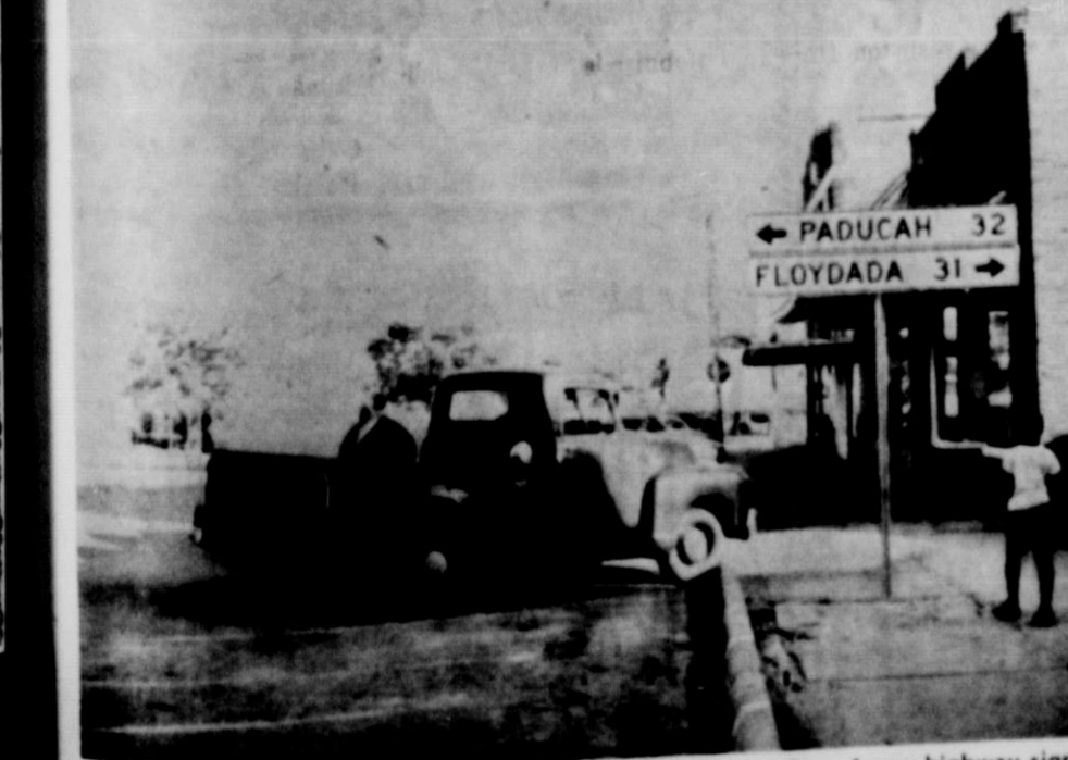
FIND YOUR WAY AROUND easy now with the large number of new highway signs installed the past week by the Texas Highway Department. The signs mark the state and US highways and Farm To Market roads reached from Matador. The above sign is on Main Street, set in and Farm To Market roads reached from Matador. The intersection stop sign (not visible in the late afternoon photo) would be about even with the rear end of the pickup.