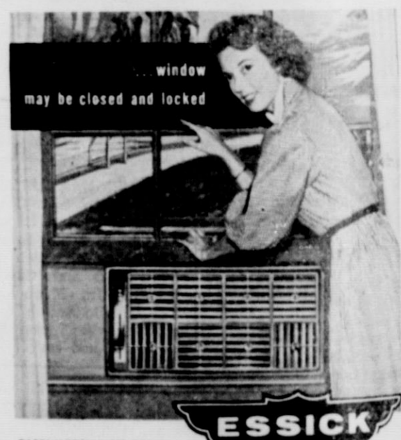
CAPRI MODEL - 4000 CFM