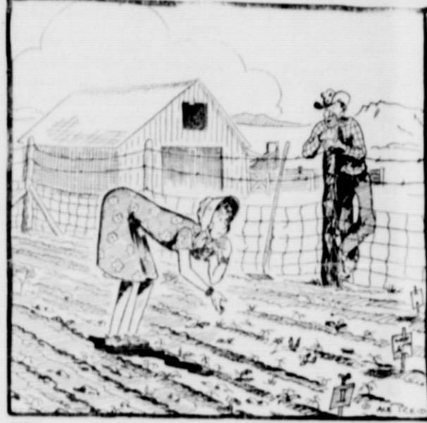
"If it wuz't fer pore land, no rain, grasshoppers and worms, I bet you'd have a purty garden!"

This feature sponsored by THE FIRST STATE BANK