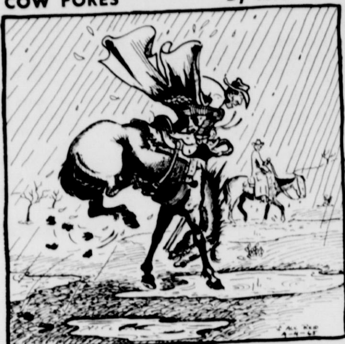
'Dang slicker! Without it I git pneumonia! With it I git killed!"

This feature sponsored by THE FIRST STATE BANK