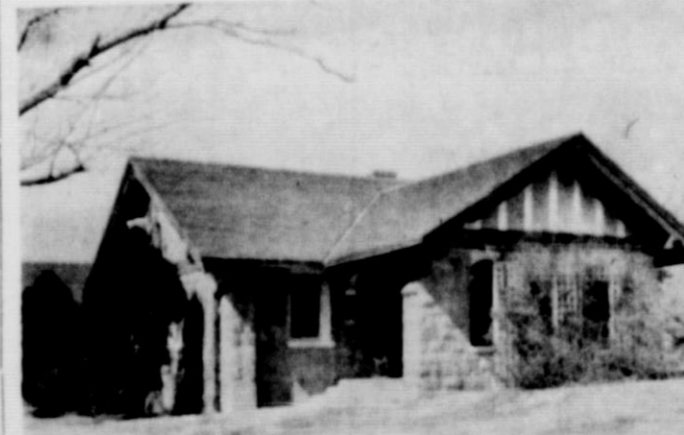
HISTORIC Matador Ranch Headquarters house, one mile southwest of Matador, will be open to the public, 10 to 12 a.m. Friday, (August 5) and 10 to 12 a.m. and 2 to 4 p.m., Saturday, (August 6). The large house was built about 1918, from native stone quarried on the site.

Antique displays will decorate the windows of places of business during the celebration.