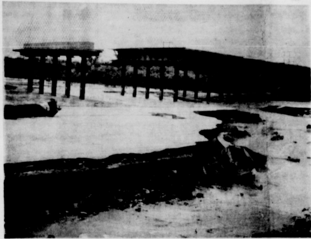
A RAINSTORM in the Foothills early Sunday sent a headrise down Middle Pease River about five miles north of Matador, where a new bridge is under construction on State Highway 70. The floodwaters cut out a section of the paved by-pass below the construction (above) to disrupt traffic between Matador and Whiteflat, Flomot, Turkey and points north. Highway crews diverted the traffic until Sunday afternoon when the river "ran down" and the breach in the by-pass was repaired. On the watershed of the river to the northwest, over four inches of rain is reported to have fallen. Approximately two-thirds of the county still remains dry.

A STORM early Sunday brought relief to part of Motley County burning under more than 100 degree temperatures for approximately two weeks. The thunder storm arriving shortly after daylight from the northwest, dropped between three and four inches of moisture on Mrs. Hope Fish's Ranch southwest of Quitaque Peaks.