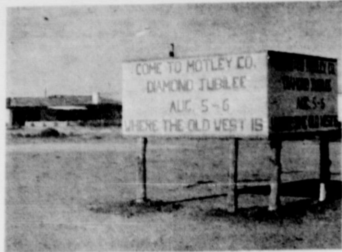
WHERE THE OLD WEST IS — Sign erected at the intersection of Highways US 70 and State 70, immediately east of El Matador Travel Center, advertising the Motley County Diamond Jubilee, next week end. The sign faces both highways and was erected by the Motley County 75th Anniversary Association.