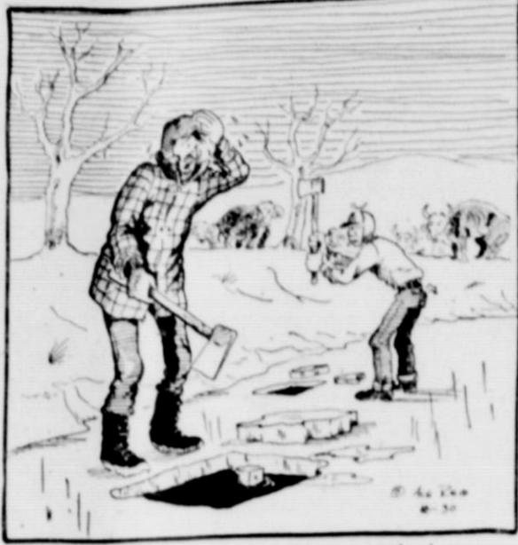
"It's all time, chop post, chop wood, chop ice. Boy, I break out with a sweat when I just look at an axe handle."

This feature sponsored by THE FIRST STATE BANK