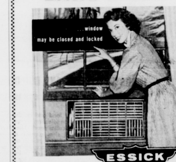
CAPI MODEL - 400 CFM