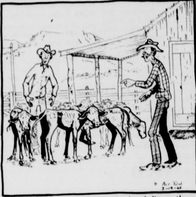
These calves ain't pore! They're bred slim so they can git thru cedar brakes without skinnin themselves up!

This feature sponsored by THE FIRST STATE BANK