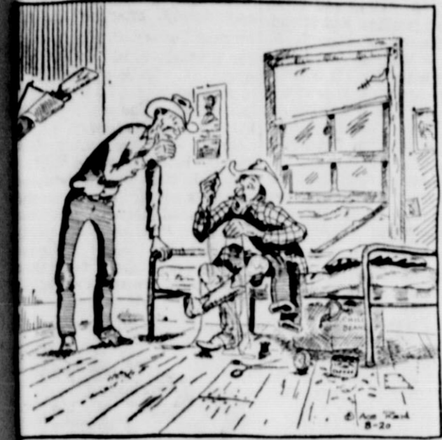
"You dang right I can sew. I ain't been sewin' up sacks all these years for nothing."

This feature sponsored by THE FIRST STATE BANK