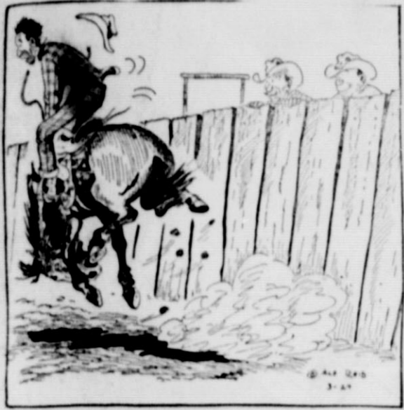
"Boys, if the saddle horn don't pull out, I think he's got 'em rode!"

This feature sponsored by THE FIRST STATE BANK