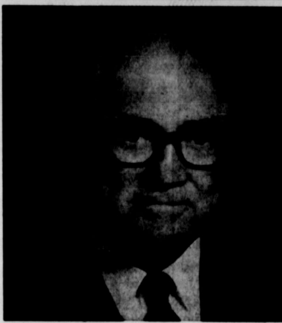
GOVERNOR PRESTON SMITH