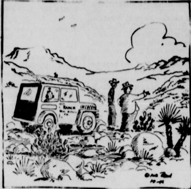
"Sure there's plenty of grazin'—there's something else in the varieties of grasses and maybe a poison weed or two."

This feature sponsored by THE FIRST STATE BANK