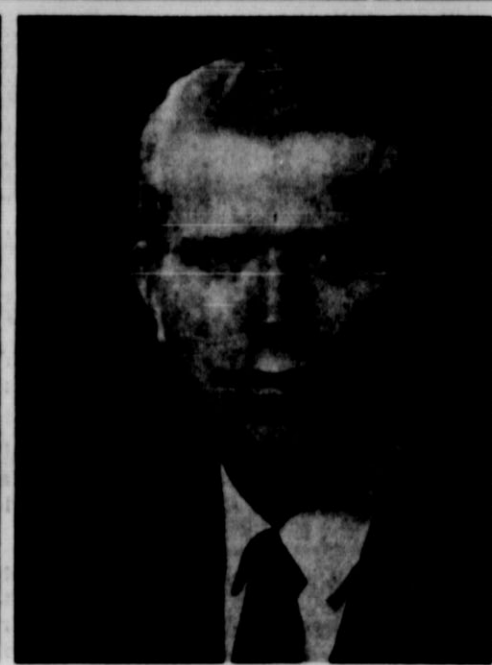
LT. GOVERNOR BEN BARNES