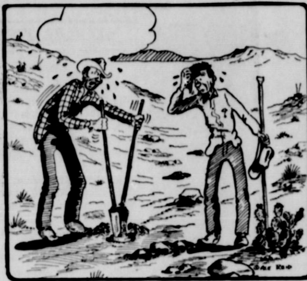
"I hope the boss realizes he's about to discourage this cowboy's great future in ranchin'."

This feature sponsored by THE FIRST STATE BANK