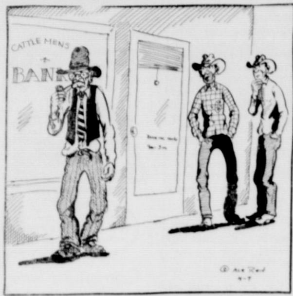
"Yeah, he's just a shepherd, but he owns 3 ranches and that bank!"

This feature sponsored by THE FIRST STATE BANK