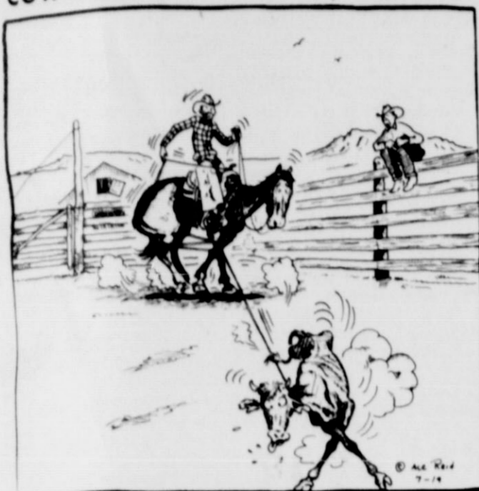
"You're right, that ropin' hoss can sure do things I've never seen before!"