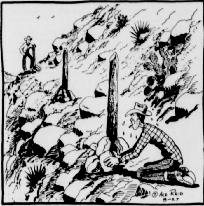
"Thought I read somewhere that some people put their post holes in the ground!"

THIS FEATURE SPONSORED BY FIRST STATE BANK