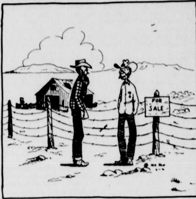
"I've been ranching on this place for 40 years and my best year I only lost $500!"