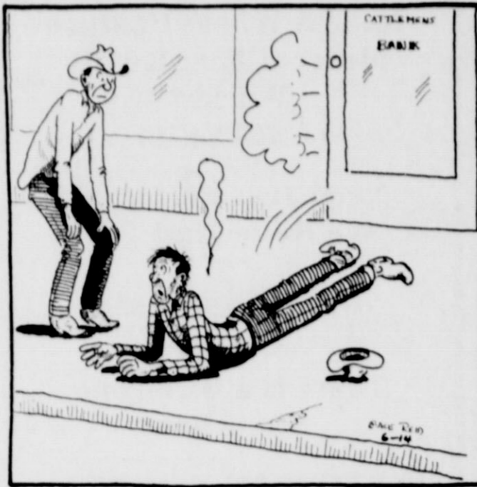
"So I say loan me $500 and I'll apply it on what I owe you, then I'd like to extend my note!"

THIS FEATURE SPONSORED BY FIRST STATE BANK