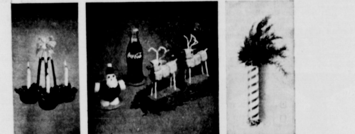
Like this... and this... and this...