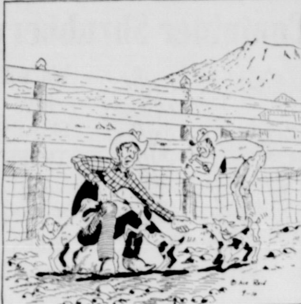
Now ain't this awful. A man of my standin a nurse maid to a bunch of goats!