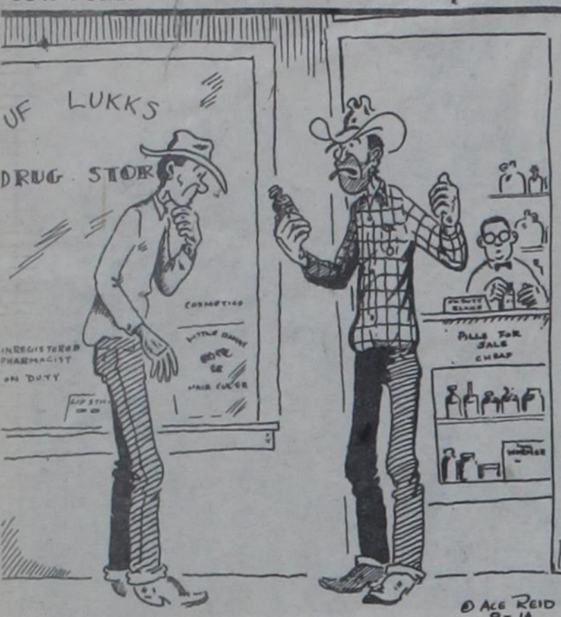
"Them's tranquilizers. He said if I took enough of 'em, I'd forget about sellin' my calves 2 months too soon and $2 too cheap!"

Some people used to put stale bread in babies' cradles in the hope of warding off disease.