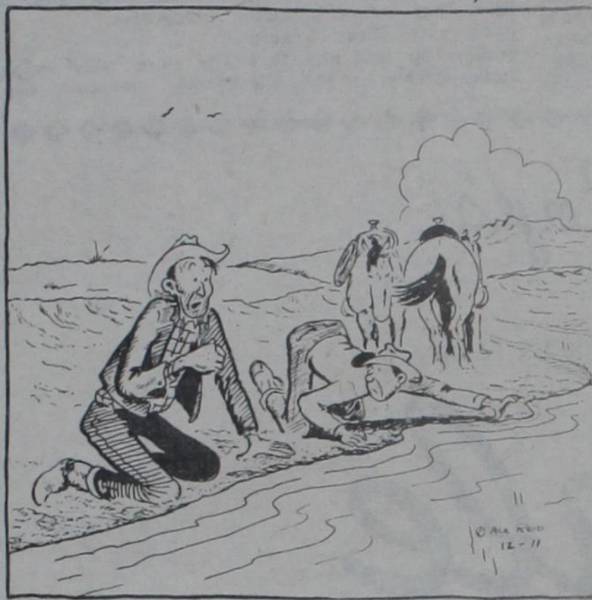
"Gosh, I thought I swallowed my tobacco, but here it is, so now I wonder if it wuz a tadpole or a bullfrog!"

THIS FEATURE SPONSORED BY FIRST STATE BANK