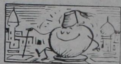
The apple originated in Afghanistan.