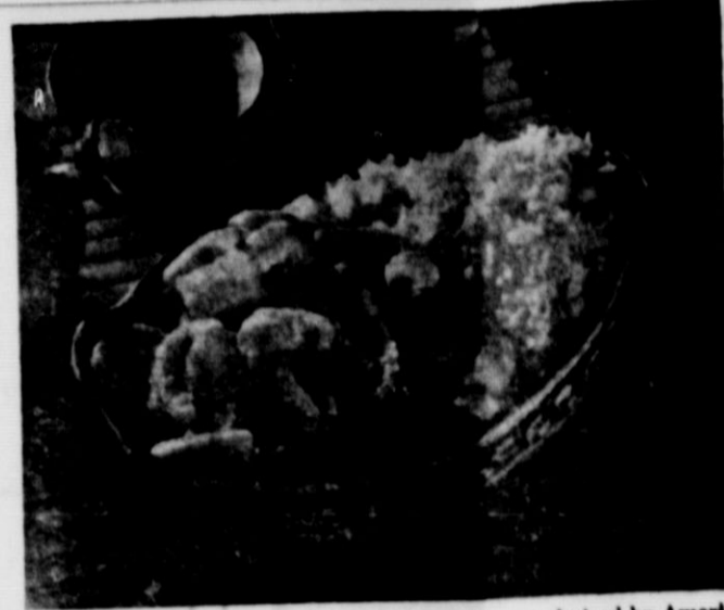
Sweet and Pungent Shrimp has an oriental flavor admired by Americans. Make it in your own kitchen—serve it with hot fluffy rice.