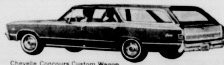
Chevelle Concours Custom Wagon

For '67, everything new that could happen... happened! Now, at your Chevrolet dealer's