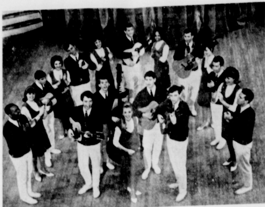
PRISON RODEO STARS - - THE YOUNG AMERICAN SINGERS have been chosen to entertain the crowds at the Sunday, October 16 showing of the Texas Prison Rodeo. Consisting of seven gals and 11 guys, the popular group was formed in the early sixties and since then they have been guests on a Bing Crosby Special; four times with Meredith Wilson's "Star Theatre Special," and have performed with singer Johnny Mathis across the nation. They will share the rodeo spotlight with tough convict riders and other entertainment features. The rodeo is held in the prison stadium at Huntsville, beginning at 2 p. m.