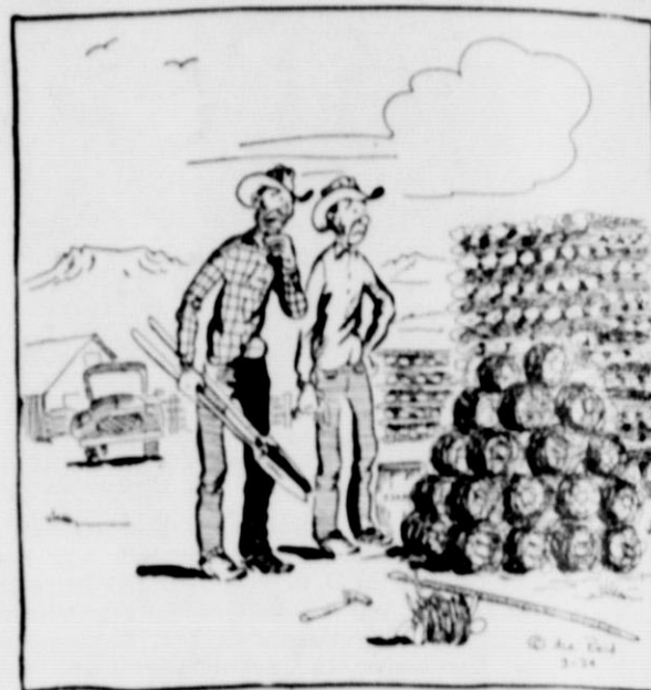
"The boss said that we oughta be inspired by the fact we're developin' the vast resources of the great West."

This feature sponsored by THE FIRST STATE BANK