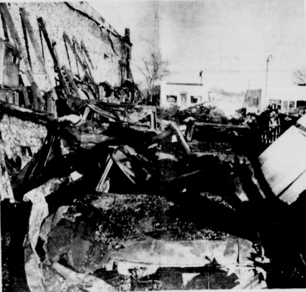
DONE TO A CRISP —New Mercury and Ford automobiles and pickups destroyed in the early morning fire which swept Matador Auto Co. storage building Thursday. Main brick building of the pioneer firm is shown at left. Photo made from point looking toward Main Street.