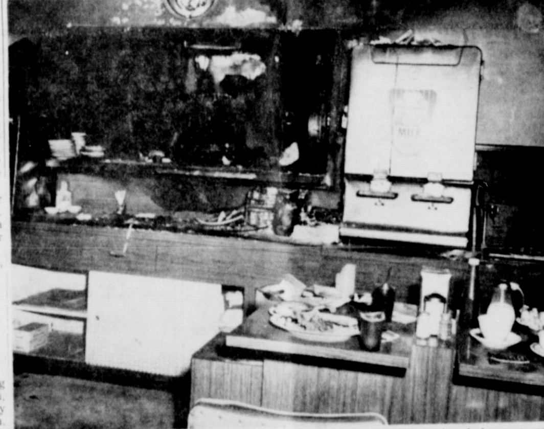
UNFINISHED MEAL in El Matador Restaurant after fire which started in kitchen during noon rush period. Notice melted glass beside order of fried chicken. Fire was six hours after Matador Auto Co.