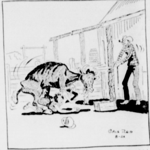
"Maw, quite excited that ole cow or she's gonna quite givin' down her milk!"

This feature sponsored by THE FIRST STATE BANK