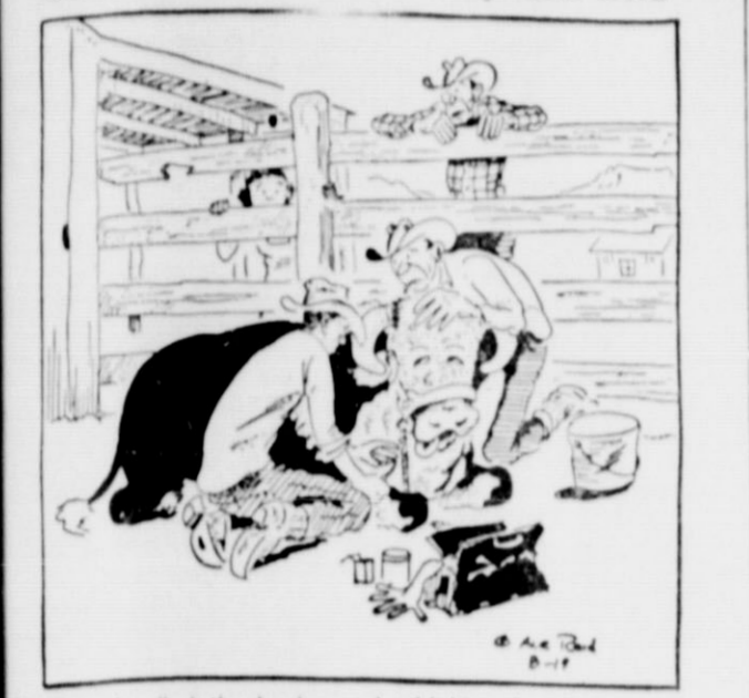
"Boys, I called the banker and told him ole Domino was snake bit, now he's sicker than the ole bull!"

Matador, Motley County, Texas, Thursday, Oct. 20, 1966