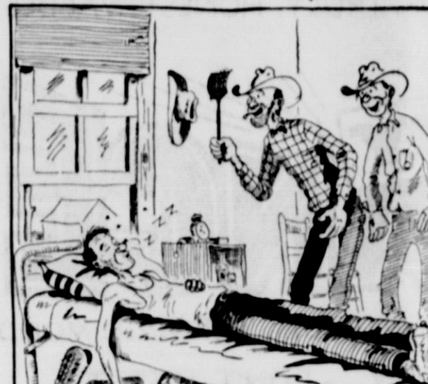
"No sir, we shore wanta keep that fly from disturbing our ole best buddy!"

This feature sponsored by THE FIRST STATE BANK