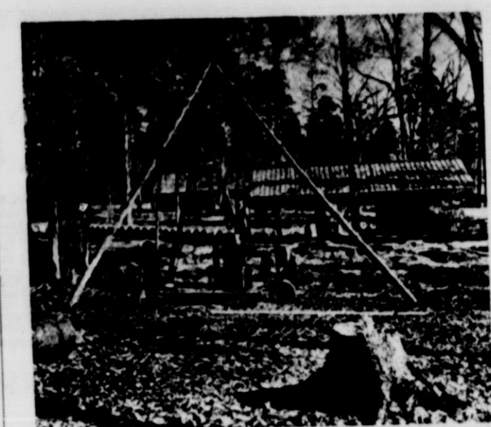
OIL SCENE IN 1880's - This rare photograph, appearing an 1891 Texas Geological Survey report, shows workmen filling barrels in Texas' first commercial oil field near Nacogdoches. It was developed about 20 years after the Barret well. Visitors to field today collect souvenir samples of oil from these wells.

you caught seed, or buy from anoth- Mix all of the soil from the difer farmer, the only safe way you ferent locations to be submitted as High School students wish to ex- can obtain this information is to one sample, and place in a mailing container which I have in my of-This service is provided by the fice. Next obtain an information Texas Department of Agriculture, 2814 34th St., Lubbock, Texas. A