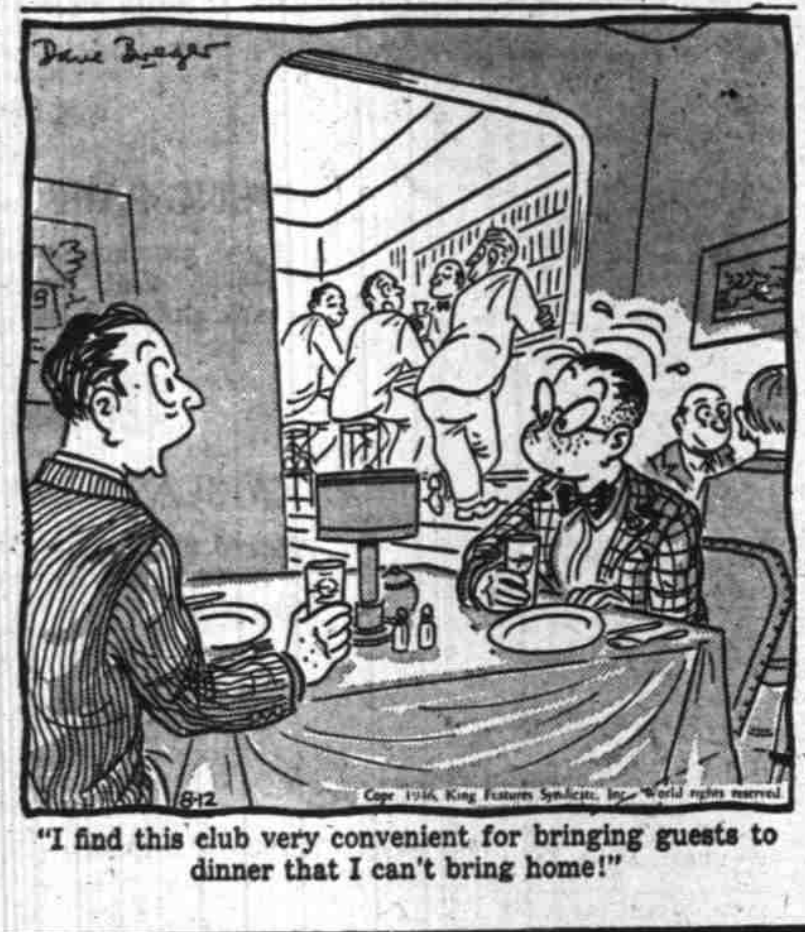
I find this club very convenient for bringing guests to dinner that I can't bring home!