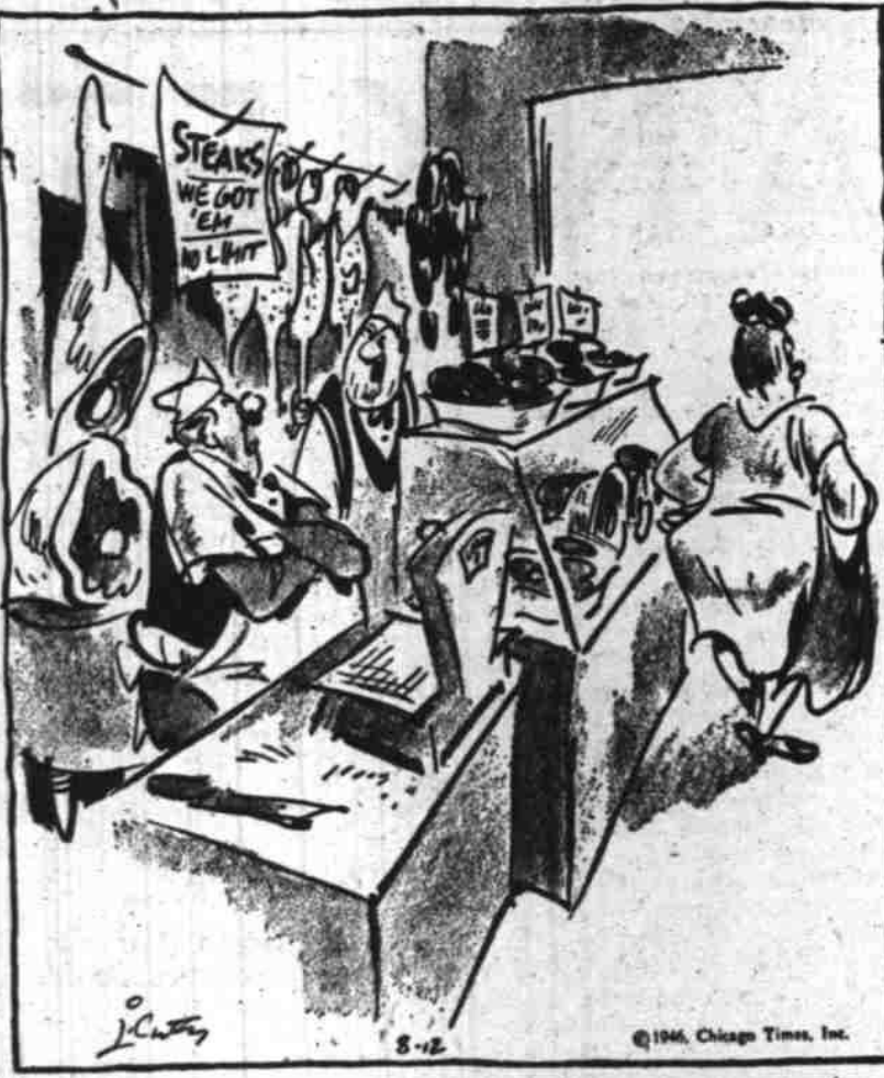
They used to say they'd pay anything for a good steak—and now that they can, they don't want to!