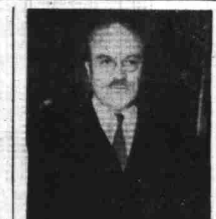
OUT HE WALKED—Soviet Foreign Minister Vyacheslav Molotov walks from a session of the Paris Peace Conference.