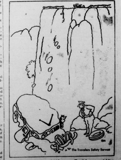
"Talk about your coincidences, officer! I was watching this very same thing on my TV set."