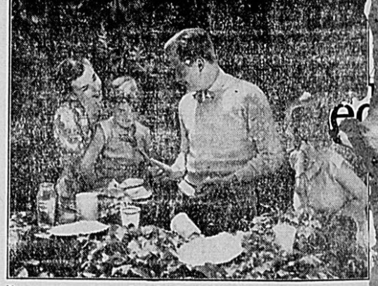
You can take a picture of the family picnic and be in it yourself by using a self timer.