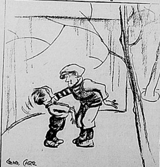
"There, Ya Dared Me T'push Ya Face In. Whatcha Gonna Do?" "What Do Ya Want Me T'do?"