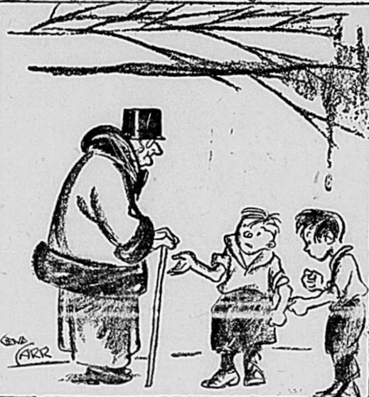
"I'll Give You Boys a Nickel If You Stop Fighting" "Give th' Winner a Quarter an' It's a Go!"