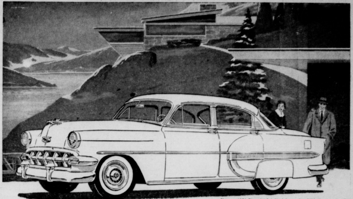
The new 1954 Chevrolet Bel Air 4-door sedan. With three great series Chevrolet offers the most beautiful choice of models in its field.

It brings back memories when a car salesman calls on us these days.