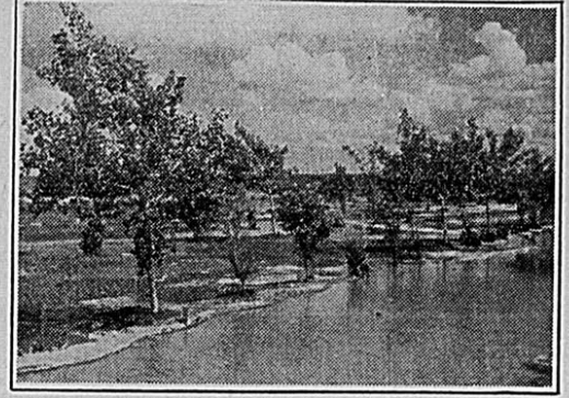
No longer is it necessary that the Plains country be a vast, treeless expanse. Farmers are finding that adapted species attain a growth of 10 to 12 feet within three years if given the benefit of additional water and frequent cultivation. Water diverted from a roadway has been diverted to this tree site on one of the Soil Conservation Service demonstration projects.