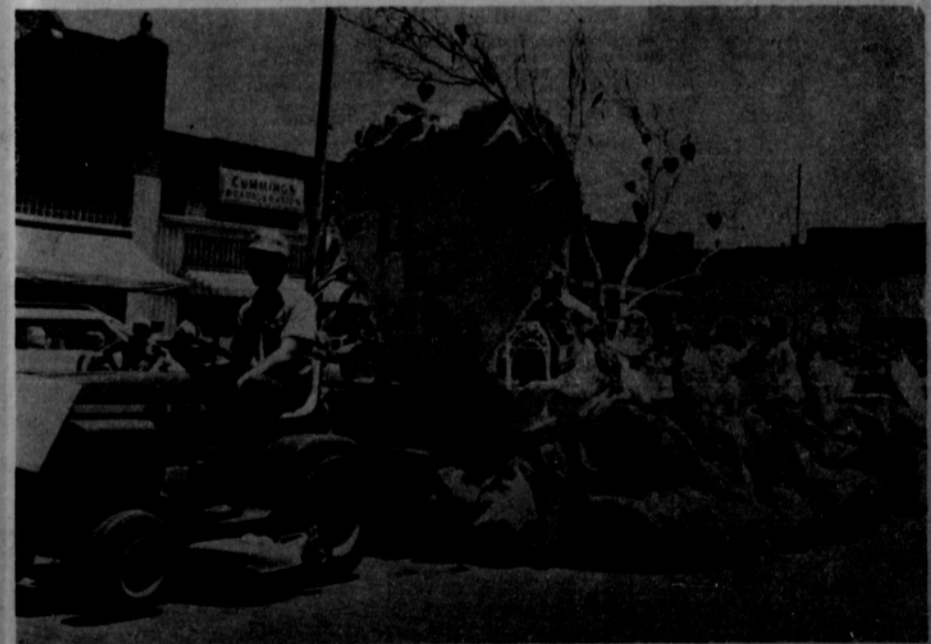
3rd place Phi Kho Chapter