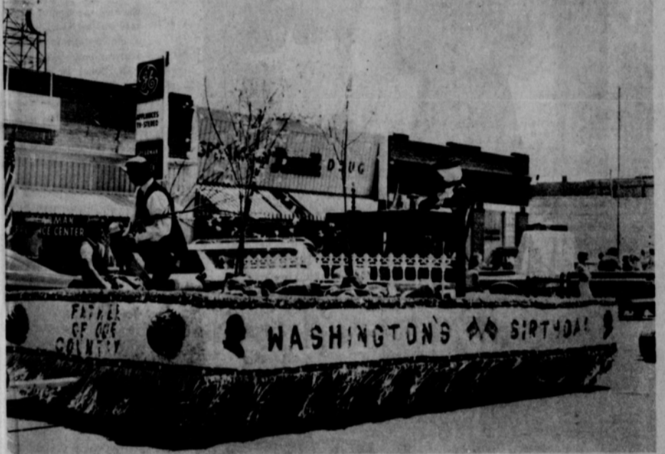
1st place float, Gladiola Club