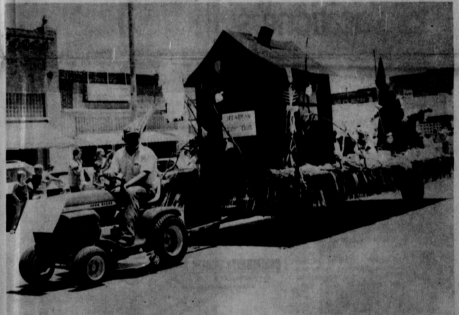
2nd place Spearman study club