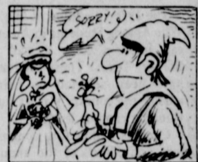
In the Middle Ages it was against the law to tie knots during a wedding ceremony.