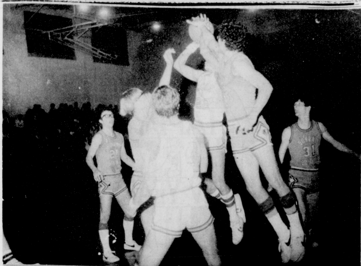
These fantastic Spearman Lynx are getting ready for their next game, Dec. 30, when they play Clarendon here in Spearman. The Lynx and Lynxettes will journey to Sanford Fritch for a January 2 game.