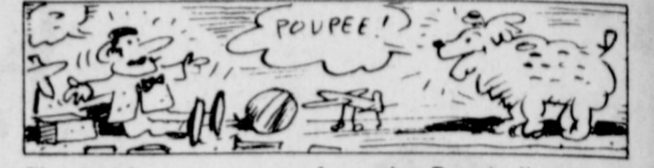
The word puppy comes from the French "poupee," meaning a dressed doll or a plaything.