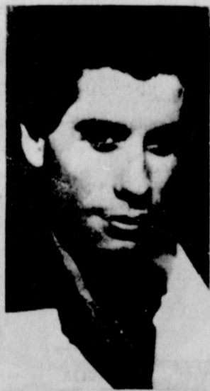
Still # SN-JF-C-1 SCENE 1B John Travolta ignites on the motion picture screen as a restless and explosive disco kingpin at the peak of his popularity in Paramount Pictures' "Saturday Night Fever."

production, is the Robert Stigwood/Allan Carr production of the hit Broadway musical "Grease." John plays the role of Danny Zuko, using his varied skills as an actor, singer, dancer, with Olivia Newton-John playing his love interest, Sandy Olsen.