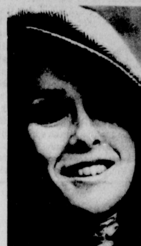
Still # SN-COMP.19 SCENE 1A Karen Lynn Gorney portrays John Travolta's love interest in Paramount Pictures' "Saturday Night Fever," a film that deals openly with the restless and explosive generation growing up in the Seventies.

As Tara on "All My Children," Karen Lynn Gorney merely had to face family feuds, fatal diseases, ill-timed pregnancies and a sweetheart called away to war. In "Saturday Night Fever" she has to hold her own as Stephanie opposite a national phenomenon called John Travolta. Karen originated the now-famous role of Tara, the one sweet and reliable centerpiece of "All My Children." They didn't want me to change Tara at all as the years went on. While I always wanted to let Tara develop, they forced her to remain one of the last vestiges of a pre-women's lib woman. If she really had to remain the same sweet thing she was in high school after all she'd been through, I think she