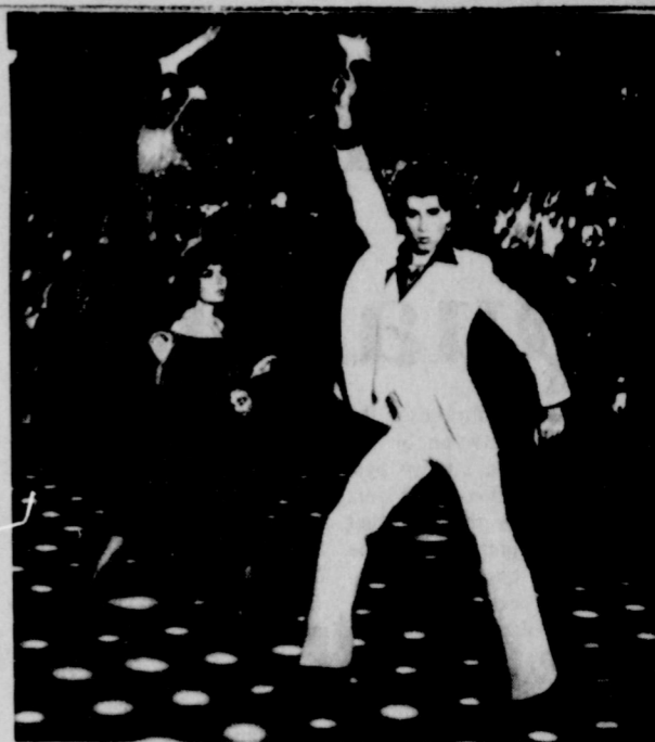
SCENE 2A John Travolta and Karen Lynn Gorney catch fire as the music explodes in Paramount Pictures' "Saturday Night Fever," which explores the restless generation growing up in the Seventies.