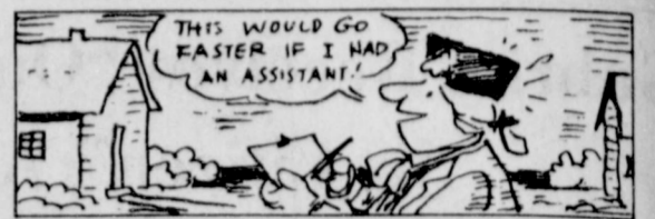
The first U.S. census, that of 1790, cost about $44,000, or just over a penny for each person counted.