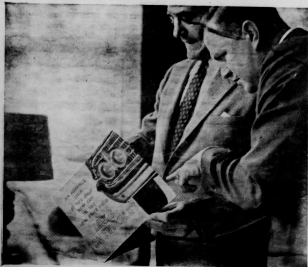
You can place your order now at Your Local Authorized Chevrolet Dealer's