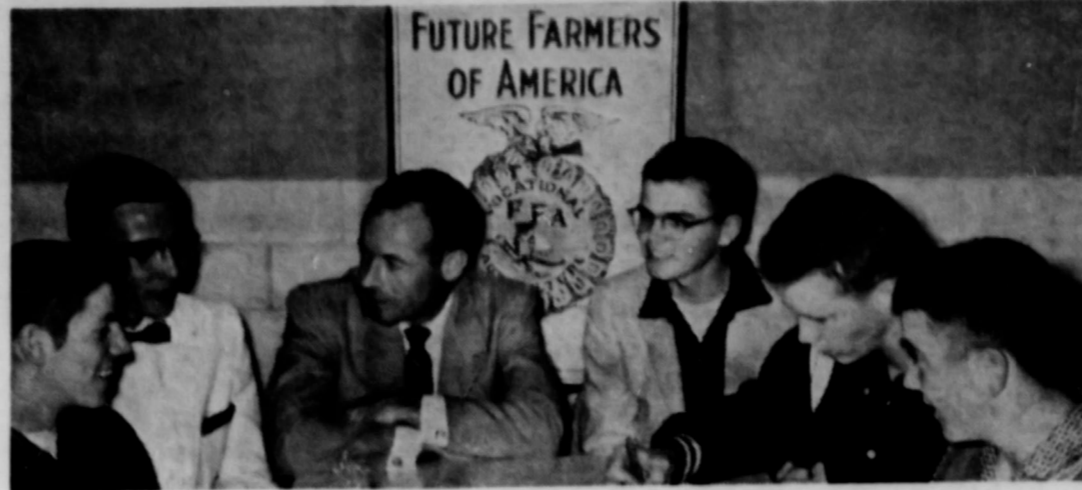
FUTURE FARMERS OF AMERICA