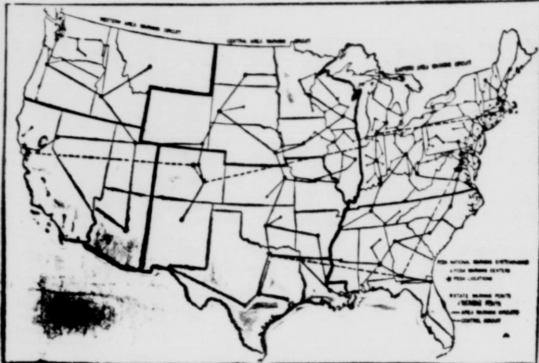
NATIONAL WARNING System. Including some 22,000 miles of wire, is shown with its intricate connections to 200 civil defense warning points across the nation. The new network may be used to sound a single national attack alarm from the Federal Civil Defense Administration's National Warning Center at Colorado Springs, or if necessary, from similar warning centers at Stewart Air Force Base, N. Y., or Hamilton Air Force Base, Calif. From the warning points, State and local civil defense hook ups would pass the word along to the people to evacuate or take shelter.