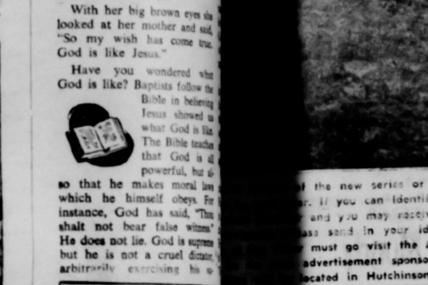
Rev. Waid Returned To

MILK PRODUCTION UP —Farmers were expecting an addition to their herds of triplets from one cow. Cattle do not triplets occur only once in 100,000 day old when this photo was taken.