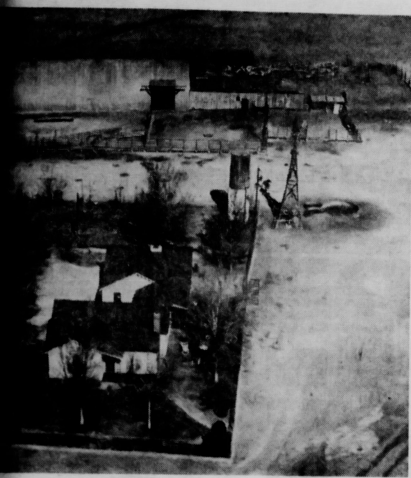
one year subscription to the county newspaper. Please send in your identification as soon as possible. Staff members of this paper must go visit the Mystery farm and write the story that appears on the page advertisement sponsored by local merchants. Some of the farm pictures will be located in Hutchinson and Ochiltree counties.