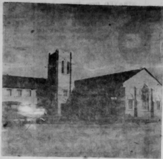
First Christian Church