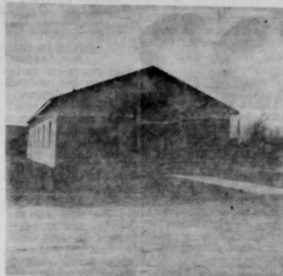
Apostolic Faith Church