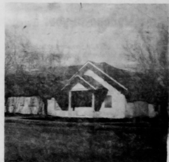
Church of Christ