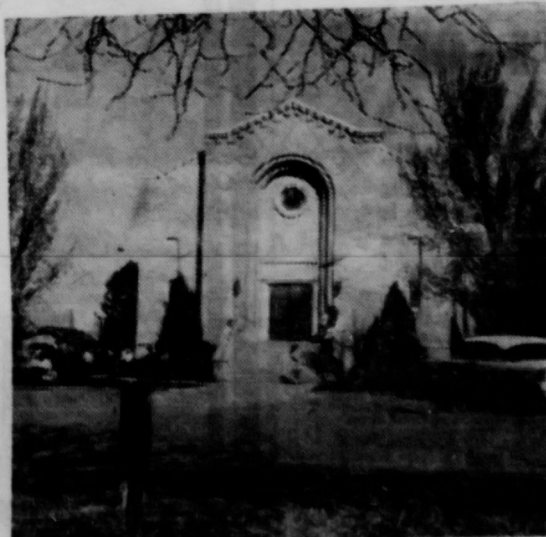
First Baptist Church

ATTEND THE CHURCH OF YOUR CHOICE THIS SUNDAY AND EVERY SUNDAY