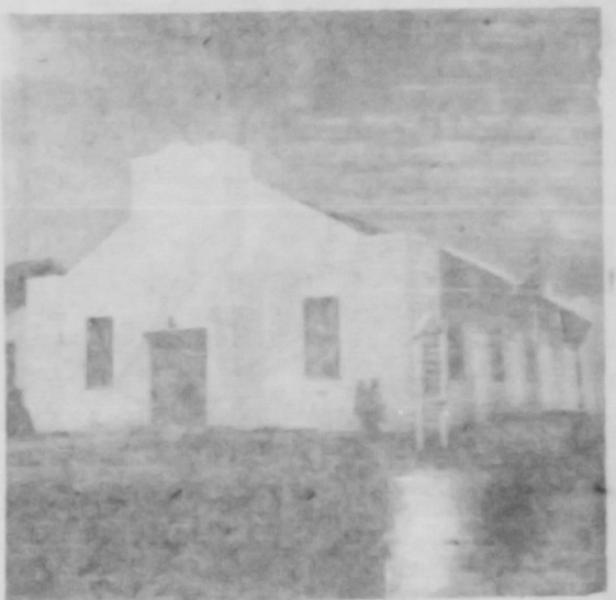
Assembly of God Church