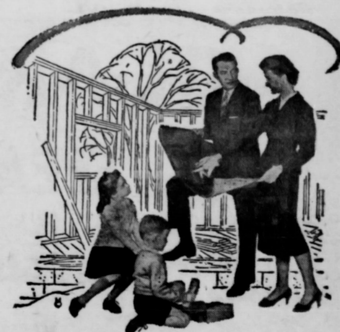
We Make Building Dreams Come True

Lower Prices to YOU Are Direct Results of This Complete Service Here at Home