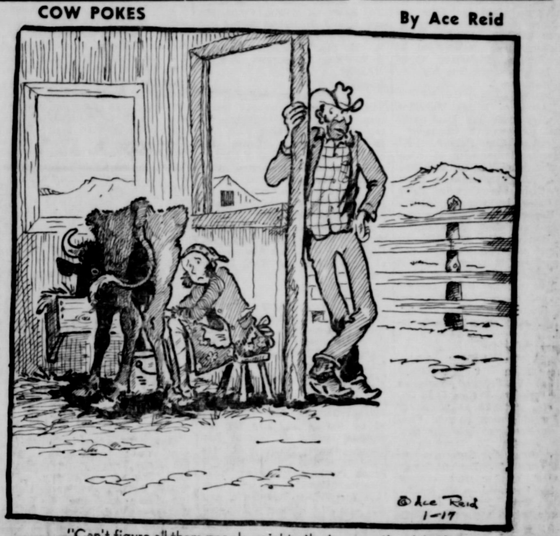
"Can't figure all them people goin' to the inauguration, Maw! Jist who's goin to do their milkin'!"