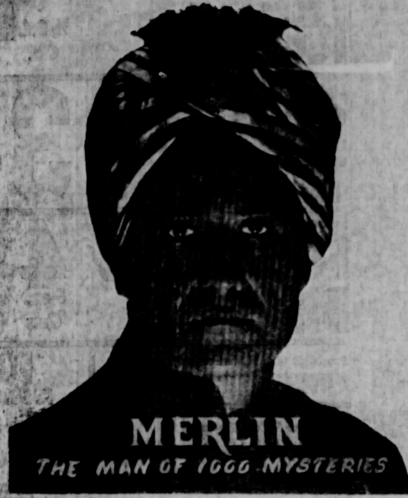
MERLIN THE MAN OF 1000 MYSTERIES