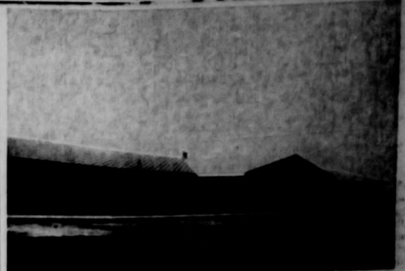
Residents moved into Pioneer Manor in 1964

Here's a whale of a buy in Office Furniture!