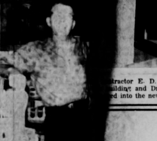
Gordon's Drug moved into the new location.