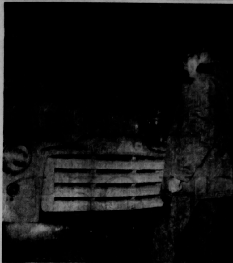
Everyone said goodbye to "OLD YELLER".