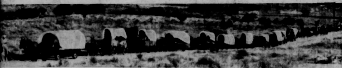
Rolling Plains Mule Train trekked to Graham.