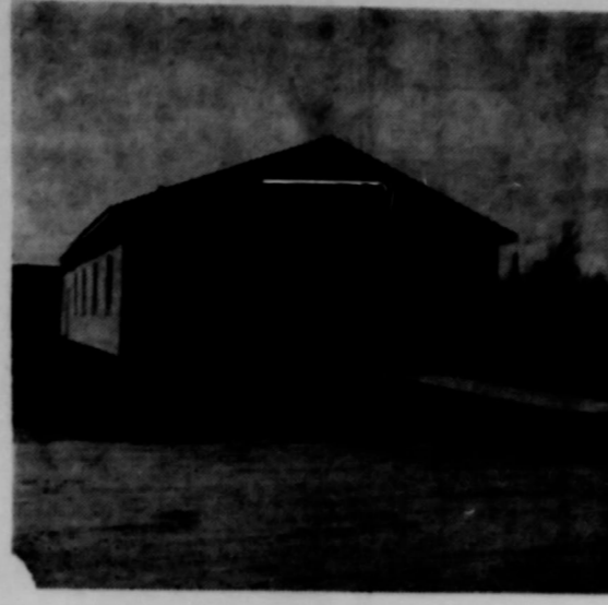
Apostolic Faith Church