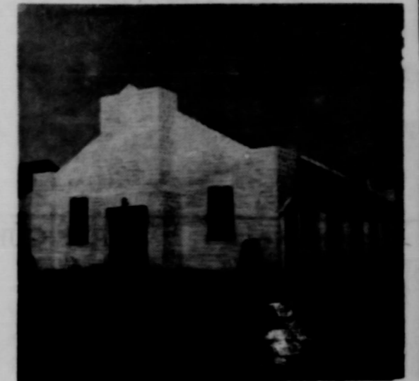
Assembly of God Church