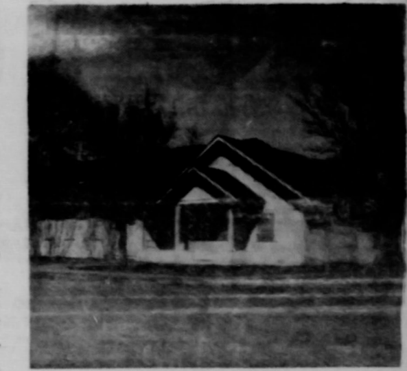
Church of Christ

FIND YOUR PLACE IN THE CHURCH OF YOUR CHOICE