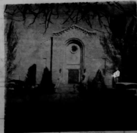
First Baptist Church