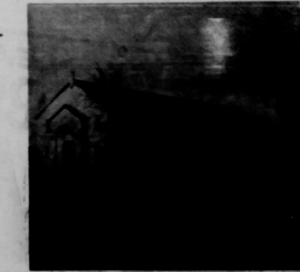
Sacred Heart Catholic Church

FIND YOUR PLACE IN THE CHURCH OF YOUR CHOICE