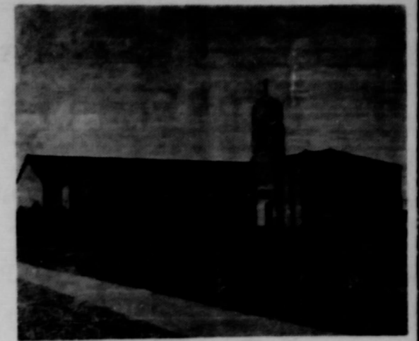
First Methodist Church