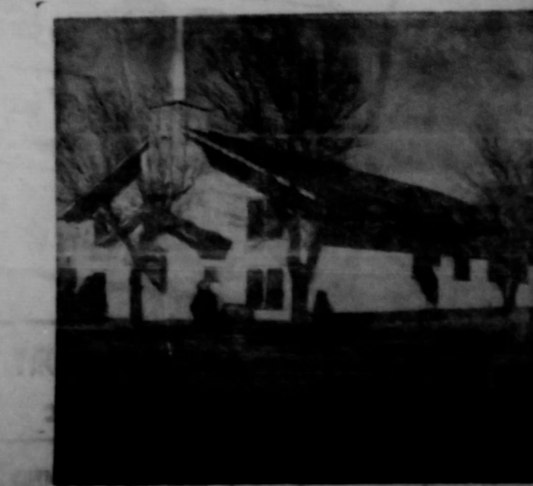
Union Full Gospel Church