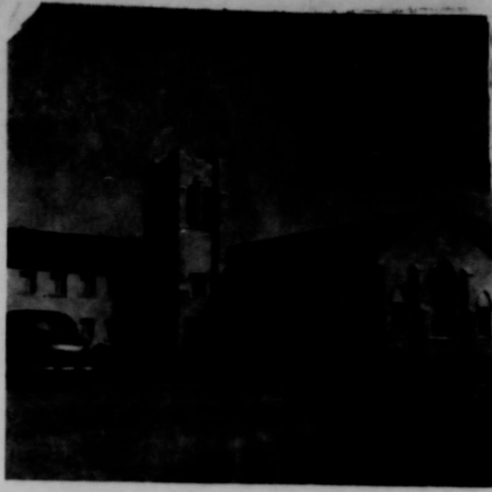
First Christian Church