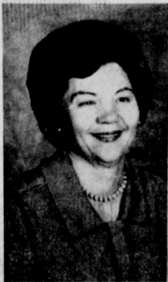
The Business and Professional Women's club met at the HD room July 28 for the installation of officers for the new year.