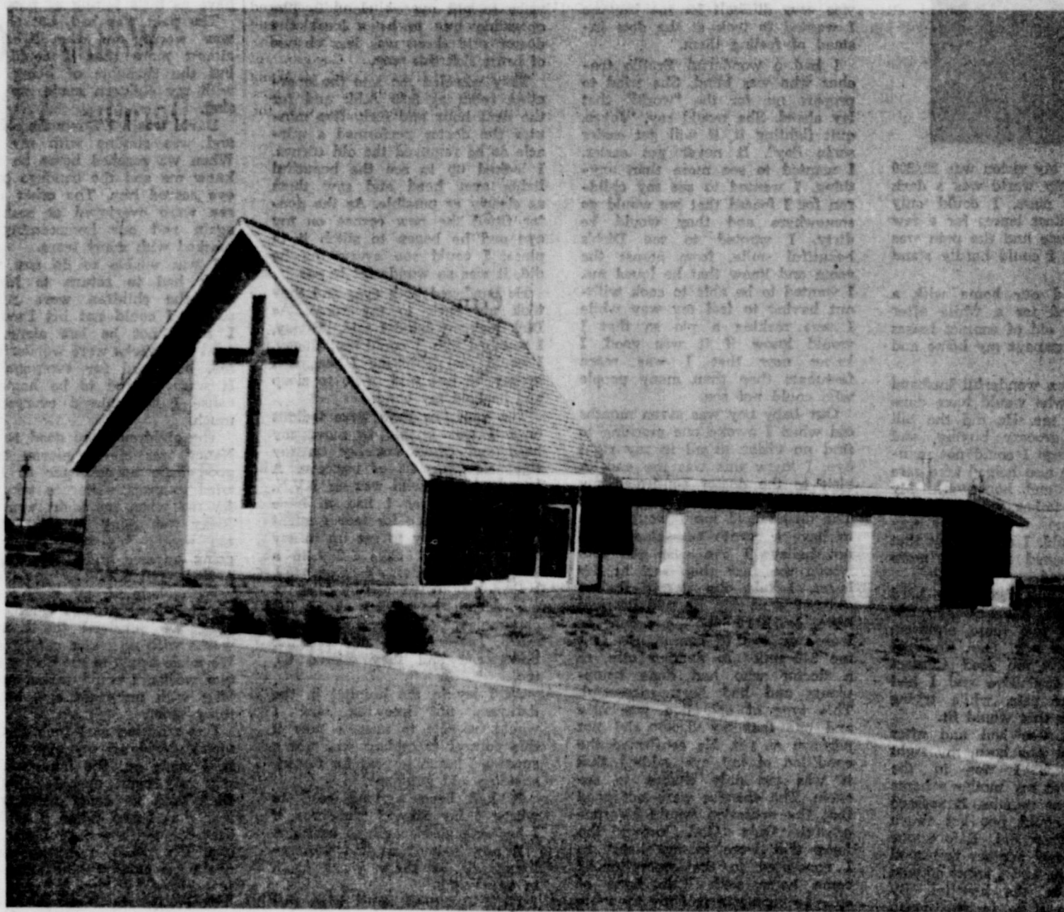
Faith Lutheran Church