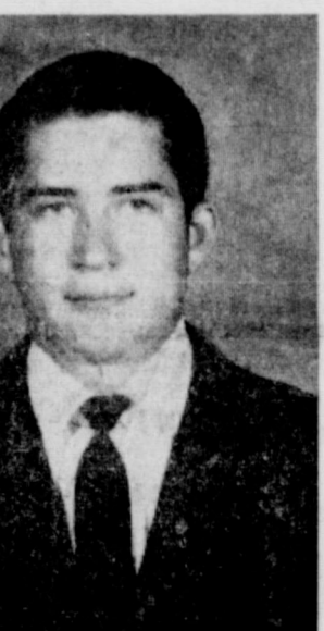
Two Spearman High School Speech students will leave Friday morning for an intensive two week workshop for high school debaters.