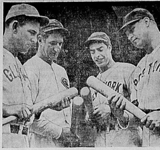
A quartet of baseball's greatest sluggers compare bats (and batting averages) at Tampa, Fla., where stars of the National league beat American league topnotchers 2 to 1 in the all-star game. Left to right: Mel Ott of the New York Giants, Ernie Lombardi of the Cincinnati Reds, Joe DiMaggio of the New York Yankees and Jimmy Foxx of the Boston Red Sox.