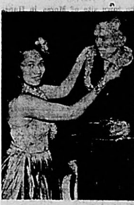
Gen. George C. Marshall, United States army chief of staff, receives a flower lei and a glass of pineapple juice from a hula girl as he steps off a plane at Hawaii, Honolulu, to inspect the territory's defense.