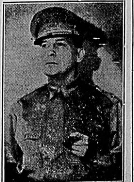
KEEPS THE FAITH — Gen. Douglas MacArthur, Commander of United Nations Armies in the Southwest Pacific, is regarded as the outstanding military leader of anti-Axis forces.

"The other day the army hauled an old country boy thru Amarillo. They were taking him to the Leavenworth federal pen. He was just a youngster, but the guy had gone to sleep while on sentry duty. And they socked him 5 years behind bars. I'm not saying this isn't right. It must be necessary, of course. But certainly his crime isn't as bad and as deliberate as an act of treason. Or as bad as irresponsible government leaders accusing loyal citizens of treason, in times like these." Old Task, 4-16-42.