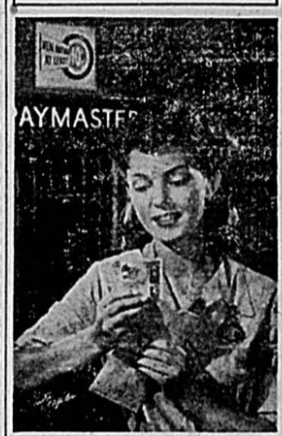
Proud of her investment in the American way of life and equally proud of the crime of war production on her face and arms, the young lady in this "Women At War Week" poster symbolizes two of the chief activities of women at war.

and 5,000,000 more men with total deductions for War Bonds over the 10 percent mark.