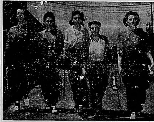
WOMEN AT WAR—Overalls, wrenches and drills replace fineries as these war workers in an Army Arsenal march to tank repair shops. Note the determination on their faces. These women are typical of hundreds of thousands who are working in war factories and investing part of their earnings in War Bonds.