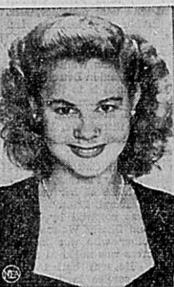
JUNE PREISSER: Shapely.

With the aid of two shades of powder, one light and one dark, you can virtually change the shape of your face. That is exactly what many stage stars do who find their faces are too round, long, square or pointed, says June Preisser, diminutive dancing star of "Babes in Arms."