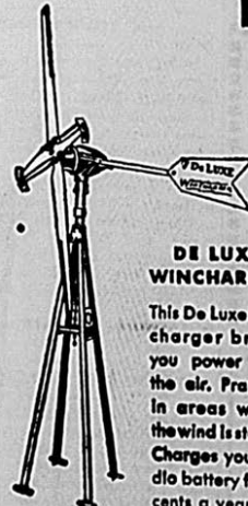
DE LUXE WINCHARGER

This De Luxe Wincharger brings you power from the air. Practical in areas where the wind is steady. Charges your radio battery for 50 cents a year.